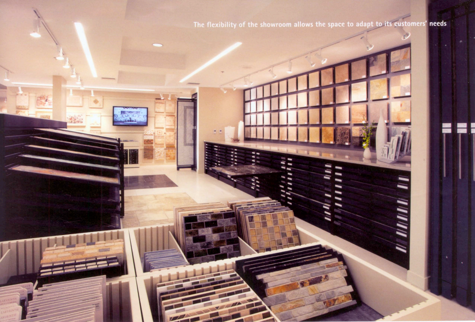
The flexibility of the showroom allows the space to adapt to its customers' needs