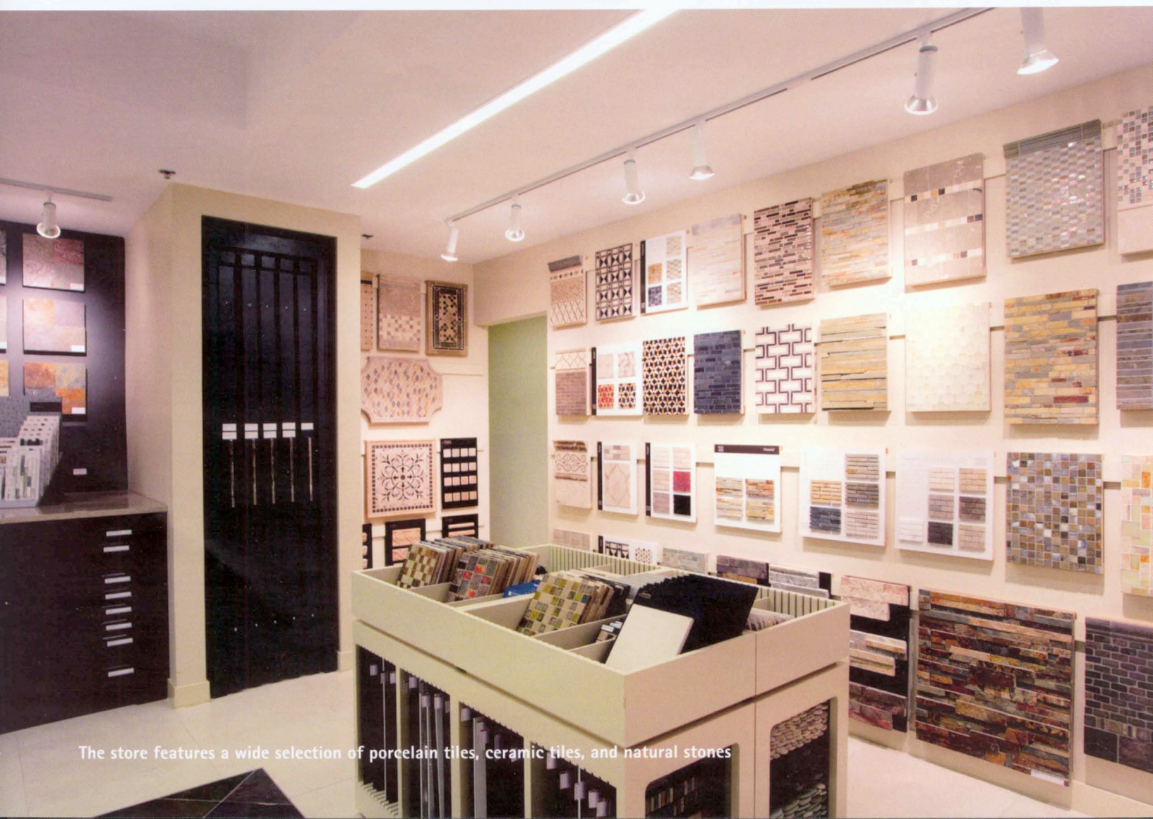
The store features a wide selection of porcelain tiles, ceramic tiles, and natural stones