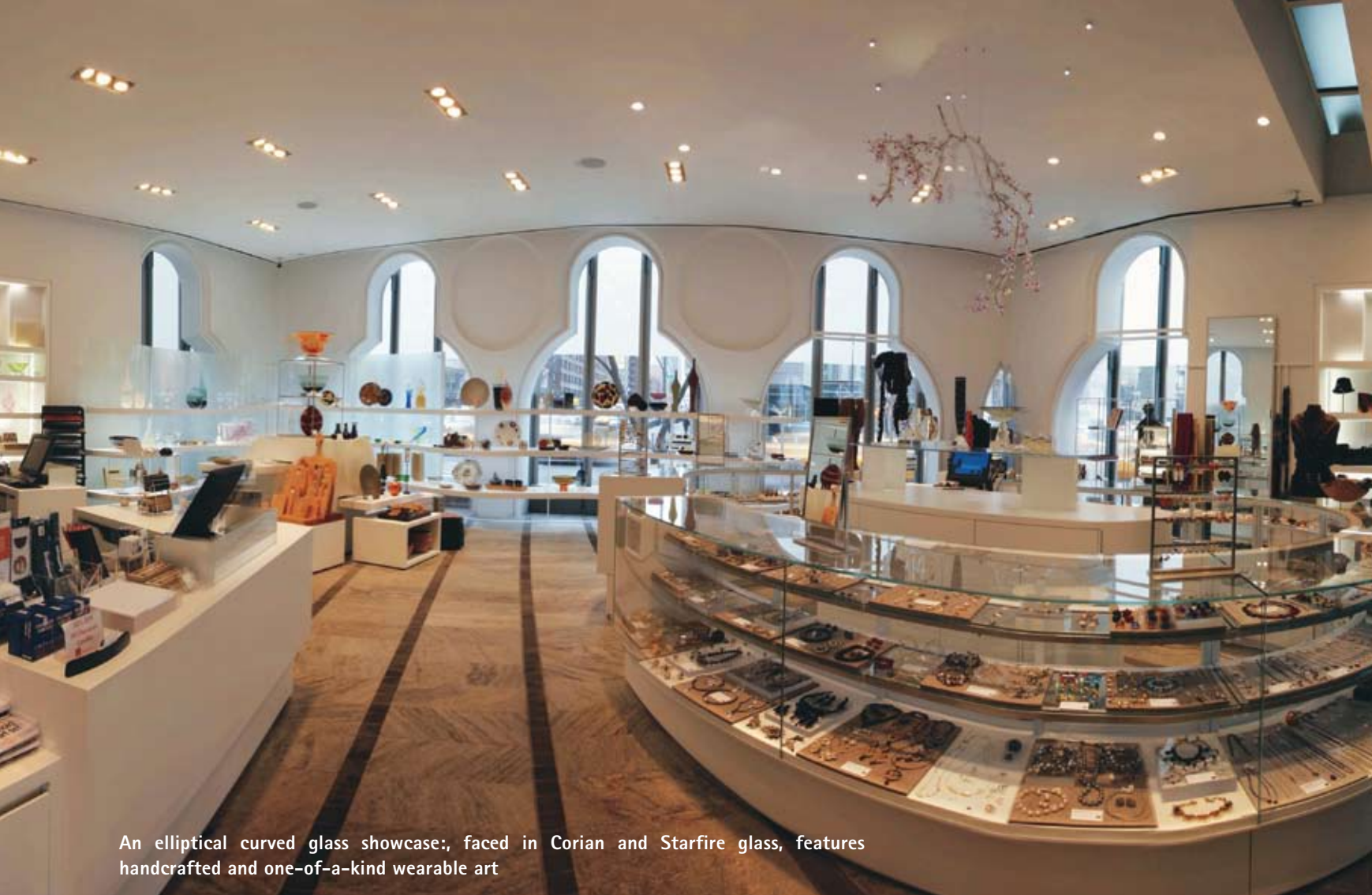
An elliptical curved glass showcase, faced in Corian and Starfire glass, features handcrafted and one-of-a-kind wearable art