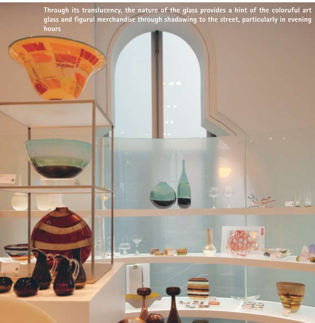
Through its translucency, the nature of the glass provides a hint of the colorful art glass and figural merchandise through shadowing to the street, particularly in evening hours