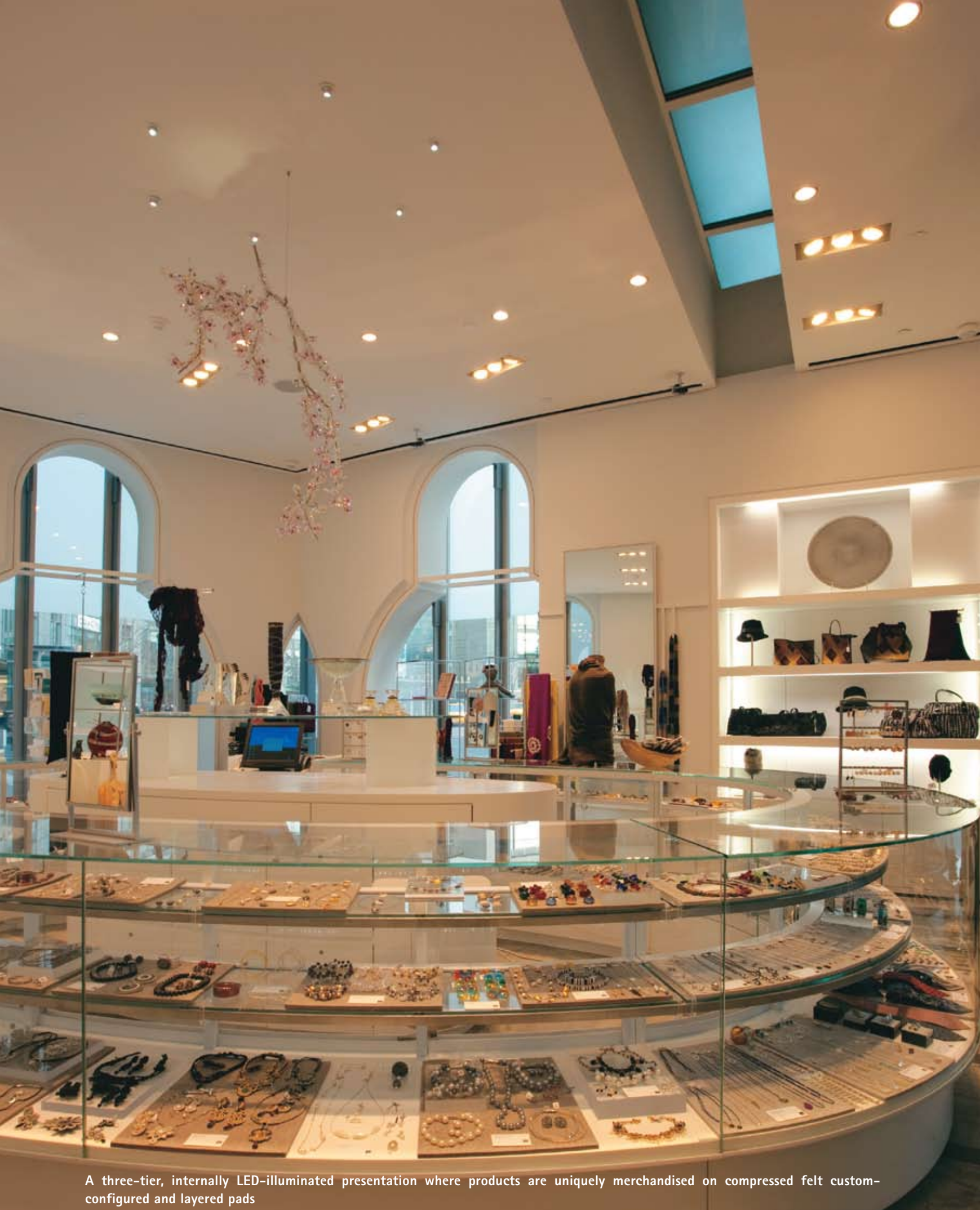
A three-tier, internally LED-illuminated presentation where products are uniquely merchandised on compressed felt custom-configured and layered pads