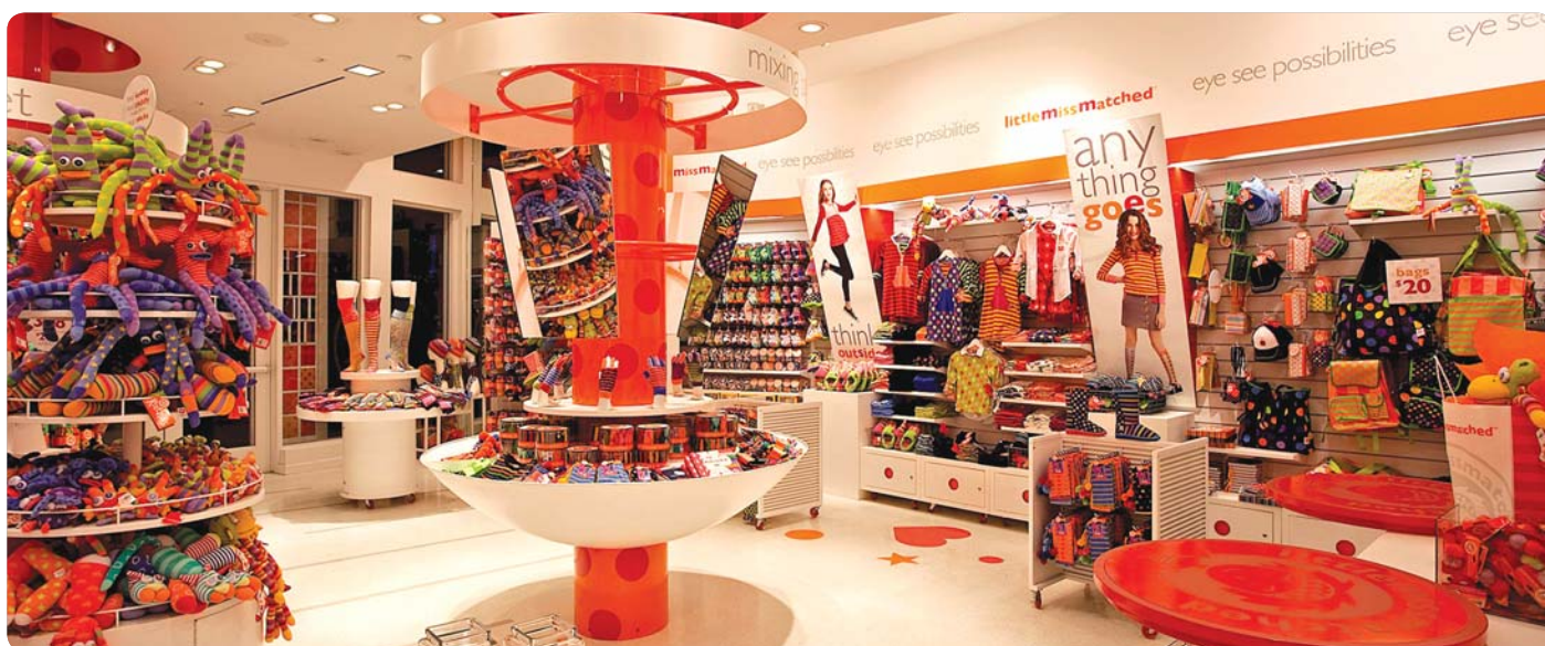
LittleMissMatched store with bright, fun merchandising

Our objective was to create a template for the brand that reflects the LittleMissMatched values of fashionable fun, creativity, individuality and innovation. Employing a visual vocabulary of forms and shapes, the store reflects these values. Functional elements include the Mixing Bowl where friends can gather, the Sock Troughs where the latest styles are displayed with try-on forms ready for mixing and matching and the Cash Wrap which, unusually, places the customer and the sales assistant side by side. Other features include a letterbox where consumers can submit suggestions to the brand and postcards which can be customised at a colouring station and exchanged with friends as a memento of the experience.