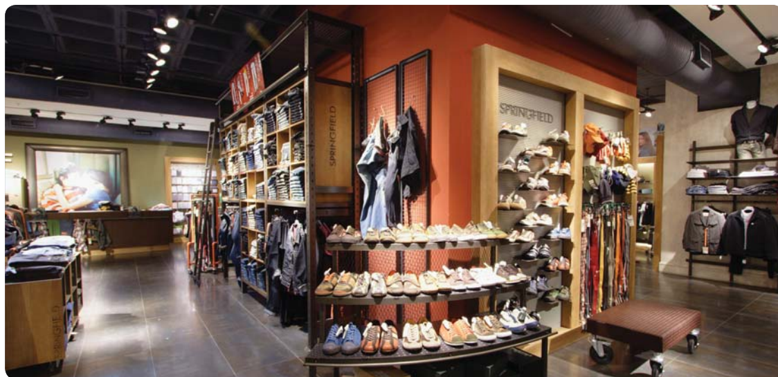
Springfield store in Madrid

Spanish retailer Springfield, another JGA client and one that offers fast fashions of 'use-right' quality, has established a youth-culture language that transcends national identity, geography and gender. Its theme may be summed up as 'Born in Europe but ready for the world', suggesting a young, carefree lifestyle full of travel and with open-ended relationships. The Springfield retail environment embodies an attitude of youthful, freewheeling self-confidence to appeal to the international youth market.